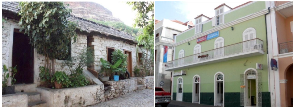
Figure 2 - Vernacular typology (left) and colonial typology (right).

The architectural design of the Archipelago cities are essentially the heritage of the trends from the Portuguese cities layout, patent in the dwellings of stone masonry with mortar of clay and sand, with ceramic tile coverings, usually a high roof-rise , the front porch and protection flaps over the windows (Figure 2 to the right) (Lopes, 2001).