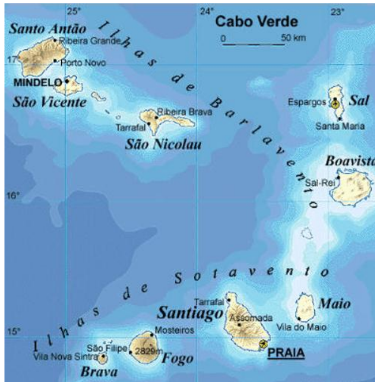
Figure 1 - Archipelago of Cape Verde.