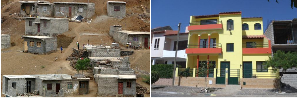
Figure 3 - Spontaneous habitations (left) and habitation in upscale neighbourhood (right).

The ecotourism construction is another contemporary trend that finds in Cape Verde a viable market seeking to be explored consciously (Barros, 2011). Most of the ecotourism buildings are based on vernacular architecture, reproducing the basalt stone houses with straw roofs (with some extra care regarding its preservation). This kind of construction allows increasing valorisation of the local context important elements, the industries and economic activities prevailing in the area, as well as the people and the environment.