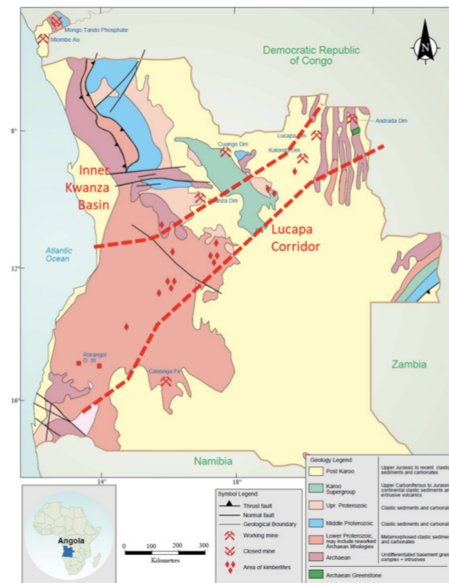
Figure 2: Map showing the Lucapa corridor. Taken from [9].

tures in the country, such as the Lucapa structure or corridor, as shown in Figure 2.