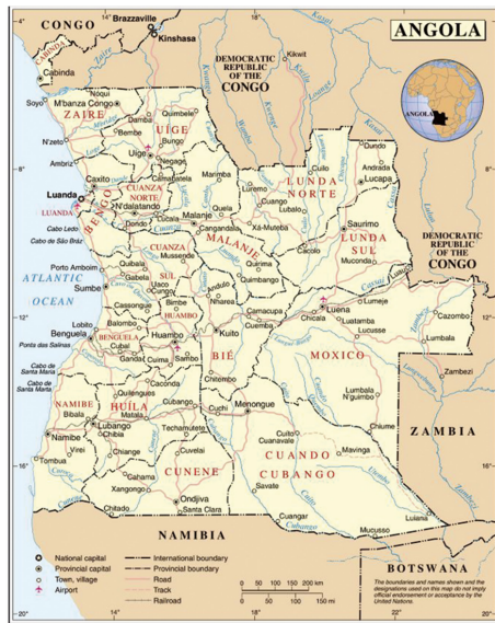
Figure 1: Map of Angola. Taken from [1].

The Republic of Angola, as illustrated in Figure 1, has an area of 1,246,700 km 2 , located on the west coast of the African continent, in the South Atlantic, with its boundaries delimited: to the north and northeast by the Republic of Congo, Namibia to the south, to the east by the Republic of Zambia, and finally to the west by the Atlantic Ocean. The country lies between latitudes 4°–18°S and longitudes 11°–24°E, and has a land border of 4,837 km and a sea coast of 1,650 km ([1].